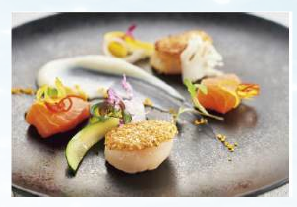
Appetizer Cherry Wood Smoked Salmon and Fresh Scallop with Cauliflower Cream Sauce