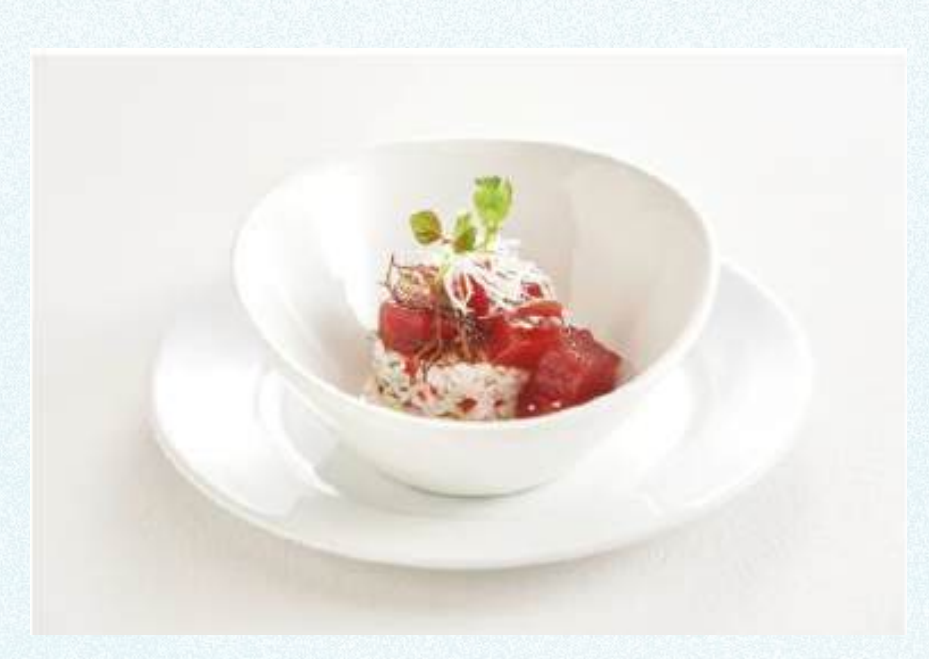
Closing Meal Fresh Island Ahi Poke Bowl "Ko Olina" Style

Gifts from the Ocean Lobster Thermidor, Lilikoi Sauce Américaine