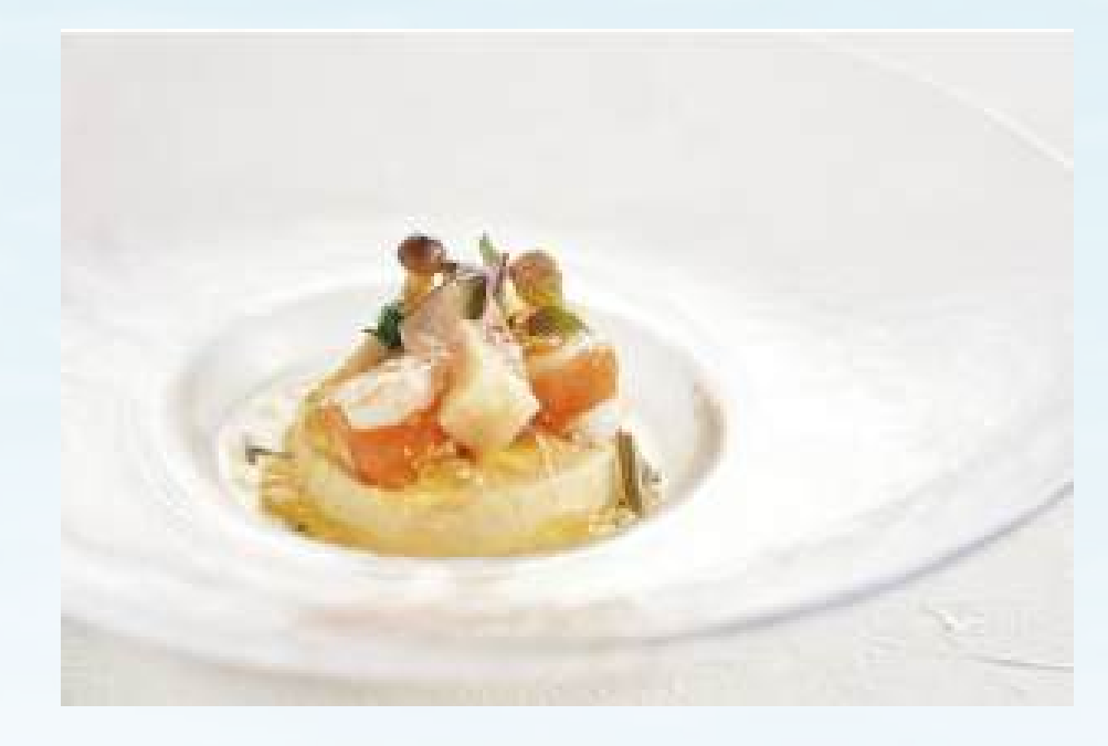
Soup Kauai Shrimp, Organic Chicken and Water Shield in Local Egg Cold Soup