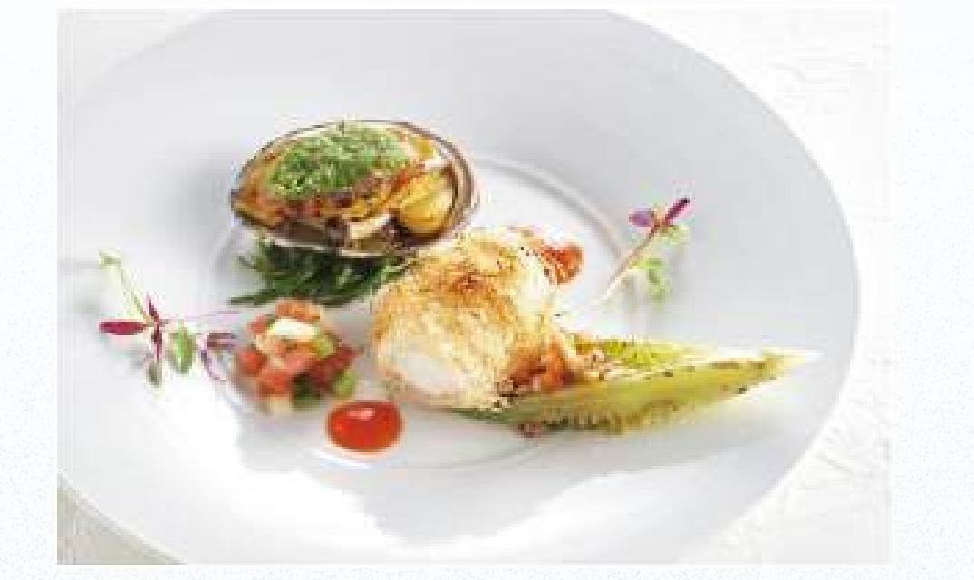
Gifts from the Ocean